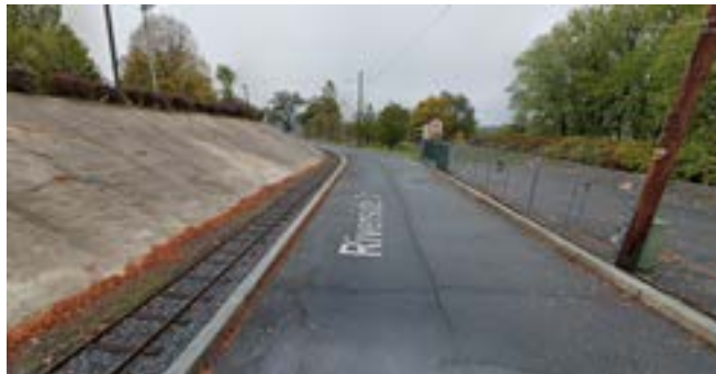
Project inspiration and install location